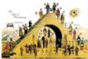
Circumambulation Eaves Dropper Installation