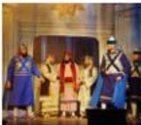
Fraternity Candidate Landmark Hoodwink Geometry Allegory Ceremony

PKBJB 7FE7FOVV TV ECF LJKVO, E7UOFX EC >NE<ND ECF V<7FO3D Y7VN, CF0033 EC LEBVL7OBLO ECF 3EVV7EB, JB3 >7D 7<J7JB>00 EC DR<JE 777D> >E J7E 70E7E0 DADF<V7D0FO ECF <E>73J7D 7EJE.