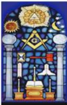
Clandestine Dedication Apprentice