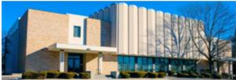
Esoteric Clothing Charity Charter Degree Brother Dotage Deacon Column Altar Master Lodge Mason