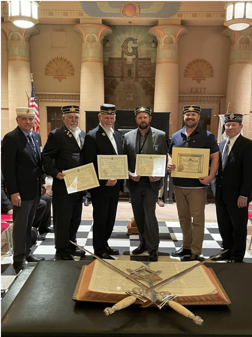
Photo from March 4 meeting Brothers receiving their patents